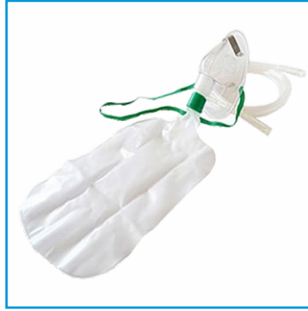
Nasal Oxygen Cannula